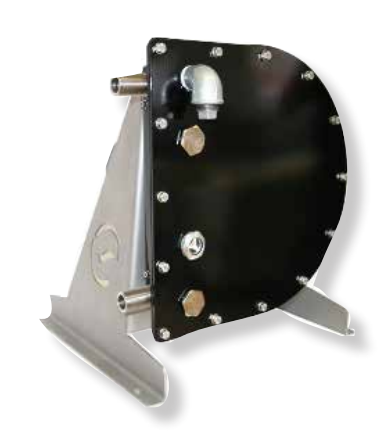
Peristaltic hose pumps are ideal for handling virtually any chemical, slurry, and additive at pumps and paper operations.

Masterflex and Enviroflex L-Series peristaltic pumps are the ideal