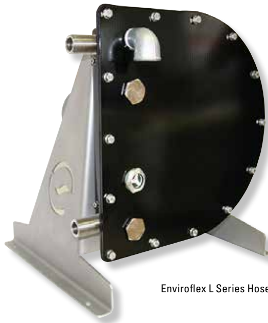
Enviroflex L Series Hose Pump

Although progressive cavity pumps have a lower initial cost, the annual lifecycle costs of a Masterflex or Enviroflex peristaltic pump over five years of service are only a fraction of that of most progressive cavity pumps. No stator or rotor replacement required, no dilution of pumped media or deadhead pumping, no hassles. They also can run dry and don't require expensive ancillary equipment such as mechanical seals and seal water flush systems.