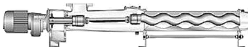
Progressive Cavity Pump

In addition, the stators also can entrap abrasive particles, which will significantly shorten the life of the stator and rotor. The pumps can also lose reliability when pumping aggressive chemicals. Seal failure can be a constant problem, allowing abrasive or corrosive materials to erode the numerous components in each joint. Most maintenance tasks, including replacing seals and stators, require almost entire disassembly of the pump.