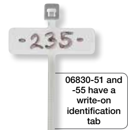
06830-51 and -55 have a write-on identification tab