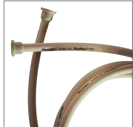
I/P PharMed® BPT sanitary tubing features pre-molded ends with ½" mini-connection.